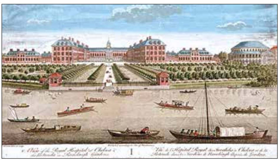
Ranelagh Gardens by the Royal Hospital with the Rotunda in background, by Thomas Bowles 1750.