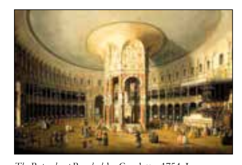
The Rotunda at Ranelagh by Canaletto, 1754.