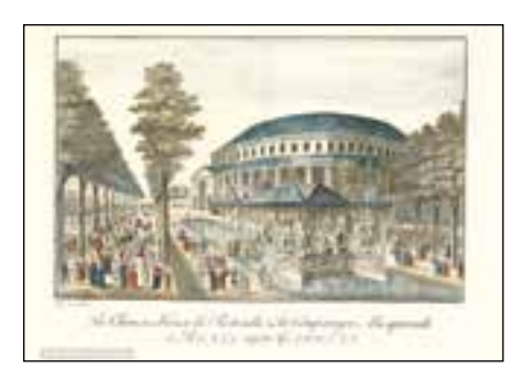
A masked ball at Ranelagh, with the Chinese bridge and Rotunda @ 1750.