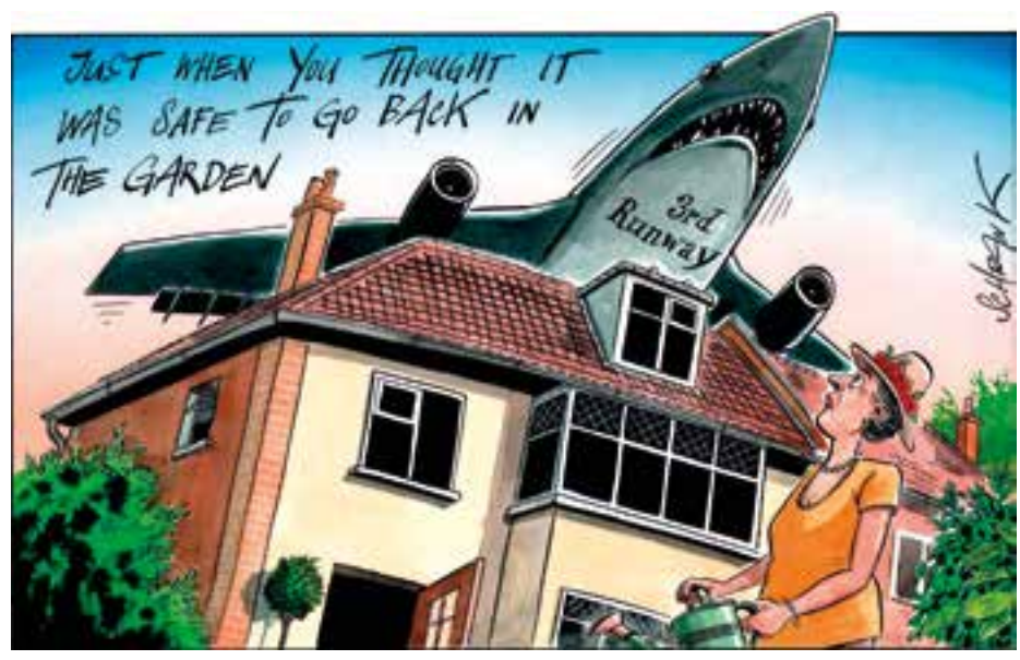
Cartoon courtesy The Independent