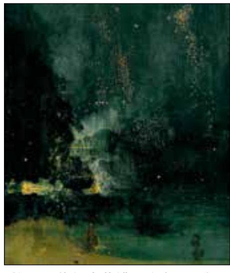
Nocturne in black and gold, falling rocket, by James A.M. Whistler, 1875, inspired by the fireworks at Cremorne Gardens