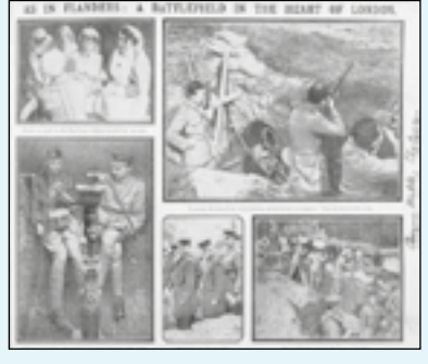
Examples of life in the trenches including shelter for nurses, field communications and defences manned by the Holborn Battalion of the Volunteer Training Coprs. Note the Chelsea Pensioners (middle image)