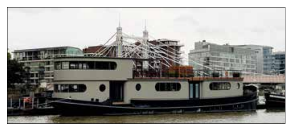
Mega-houseboat 'Flagship', moored at Cadogan Pier, currently obscures the riverside view for residents