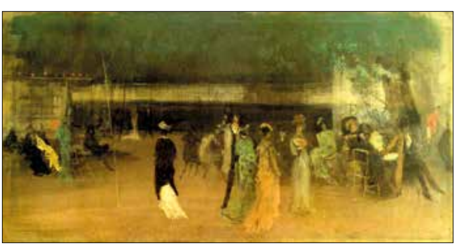
Cremorne Gardens No 2, James A.M. Whistler, 1877