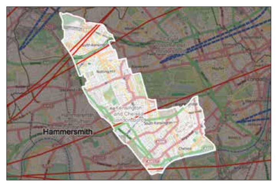
Possible new flight paths over RBK&C

According to the European Commission, at least 725,000 people live under the Heathrow flight paths; that is, 28% of all people impacted by aircraft noise across Europe. A new runway would bring a considerable number of new people under a flight path for the first time. Moreover, those communities which currently enjoy a half day's break from the noise are likely to find that reduced to a third of a day (in order to ensure people under the new runway also get respite). A third runway is expected to increase the number of planes using Heathrow by around 250,000 a year. Quieter planes and improved operation practices cannot wish that number away.