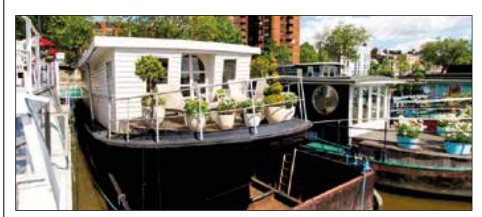
The picturesque Chelsea Houseboats have been part of the community since 1935.

Sky watching is one the joys of riverside living. The vast expanse stretches from the Shard in the east to Chelsea Harbour in the west.