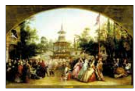
The Dancing Platform at Cremorne Gardens, by Phoebus Levin, 1864.

Chelsea's other great pleasure garden was Cremorne Gardens, located on Cheyne Walk, stretching all the way from the river to the King's Road on