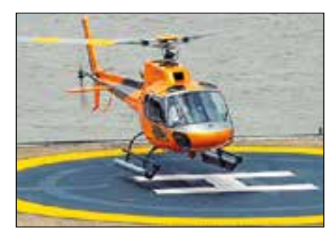
Landings at Battersea Heliport have increased

For the three Councils, Councillors have made statements supporting the recommendations: in essence all three calling on the Mayor, the Civil Aviation Authority and Government to find a sustainable solution, including re-siting the heliport. The Mayor's current Draft London Plan has not grasped the nettle to relocate Battersea Heliport and remove the blight on our lives merely stating that no new heliports will be considered.