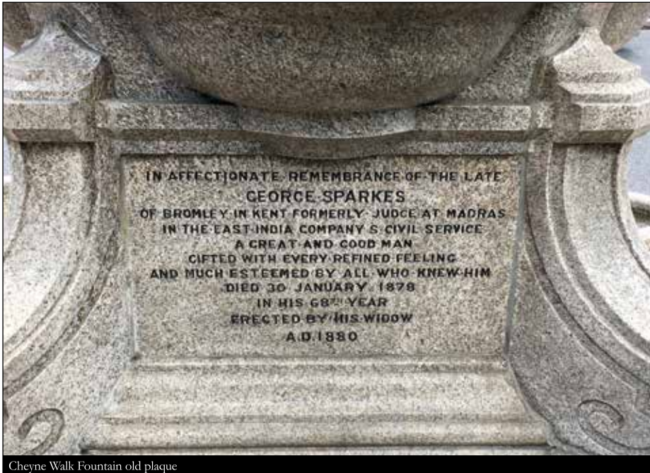
Cheyne Walk Fountain old plaque