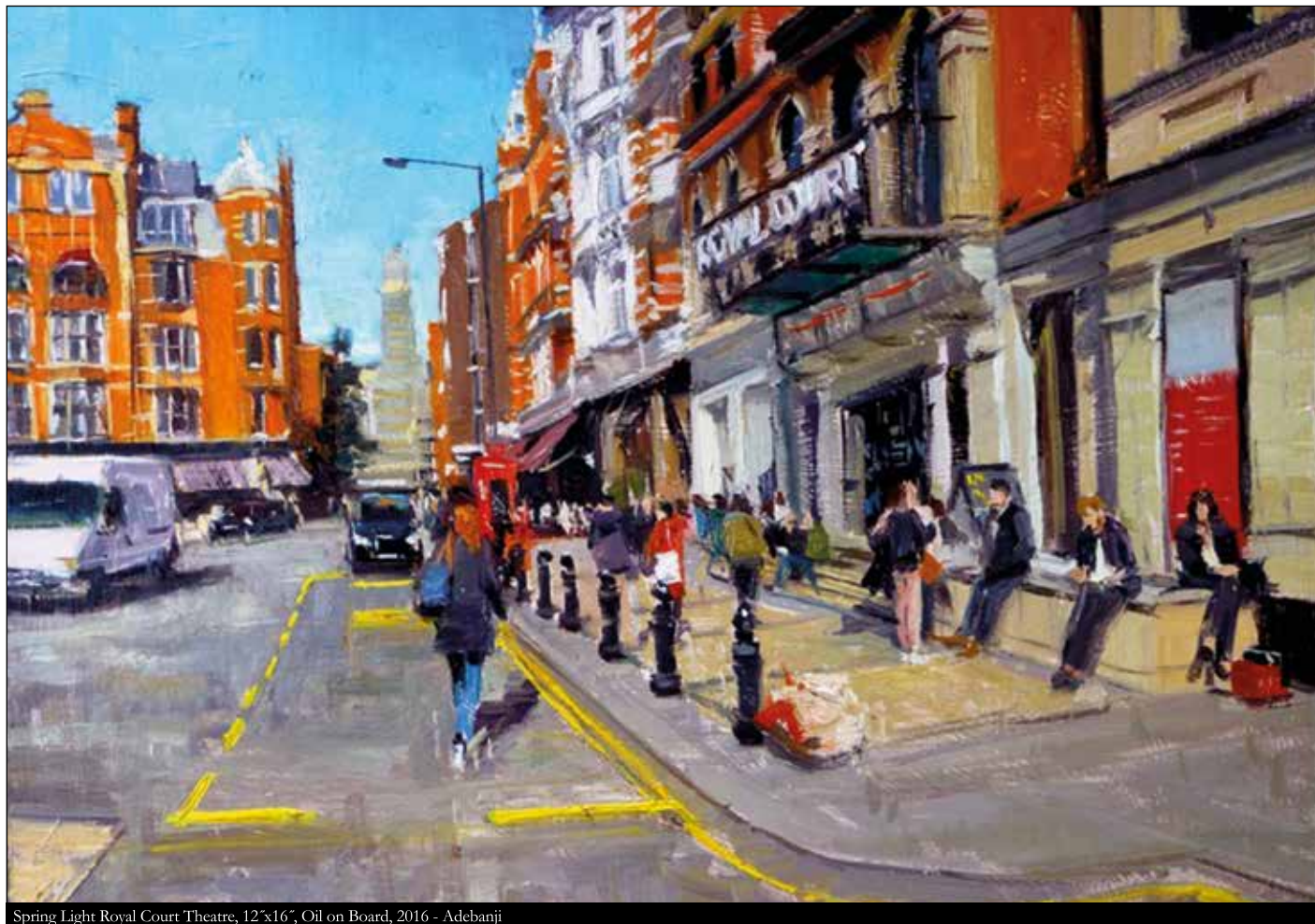
Spring Light Royal Court Theatre, 12"x16", Oil on Board, 2016 - Adebanji

“There is a spirit in man and the inspiration of the Almighty giveth them understanding”