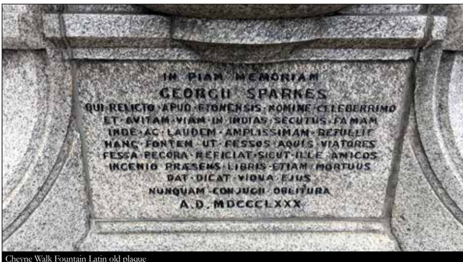
Cheyne Walk Fountain Latin old plaque