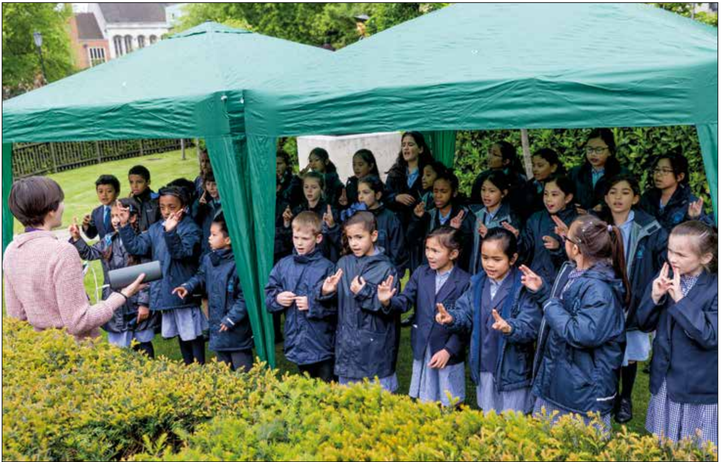
Choir of the Servite School