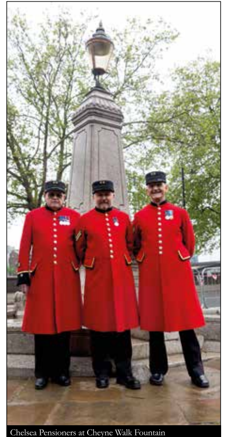
Chelsea Pensioners at Cheyne Walk Fountain