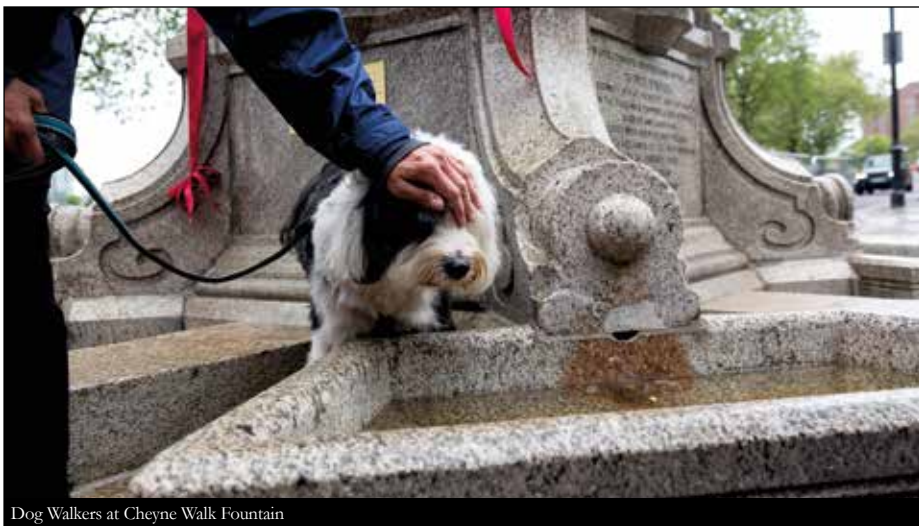
Dog Walkers at Cheyne Walk Fountain