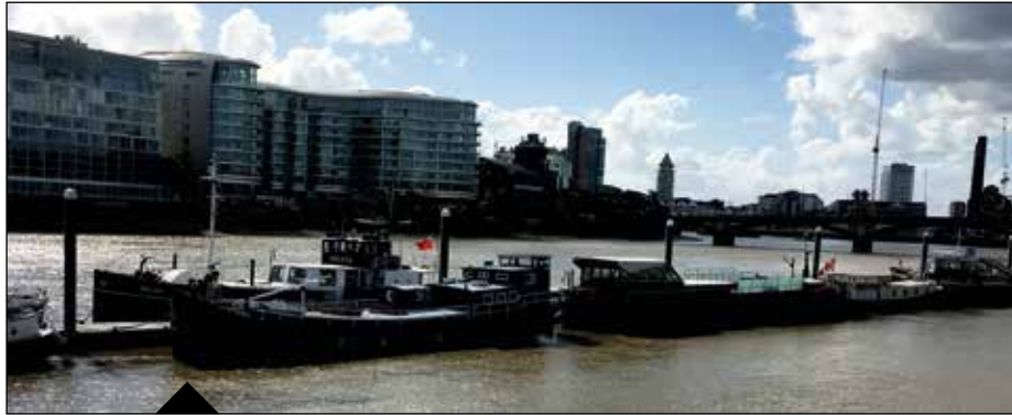
Do we want this Chelsea Riverside... OR THIS?