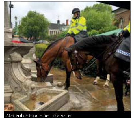
Met Police Horses test the water